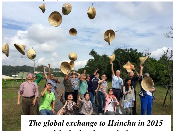
The global exchange to Hsinchu in 2015 visited a local organic farm.